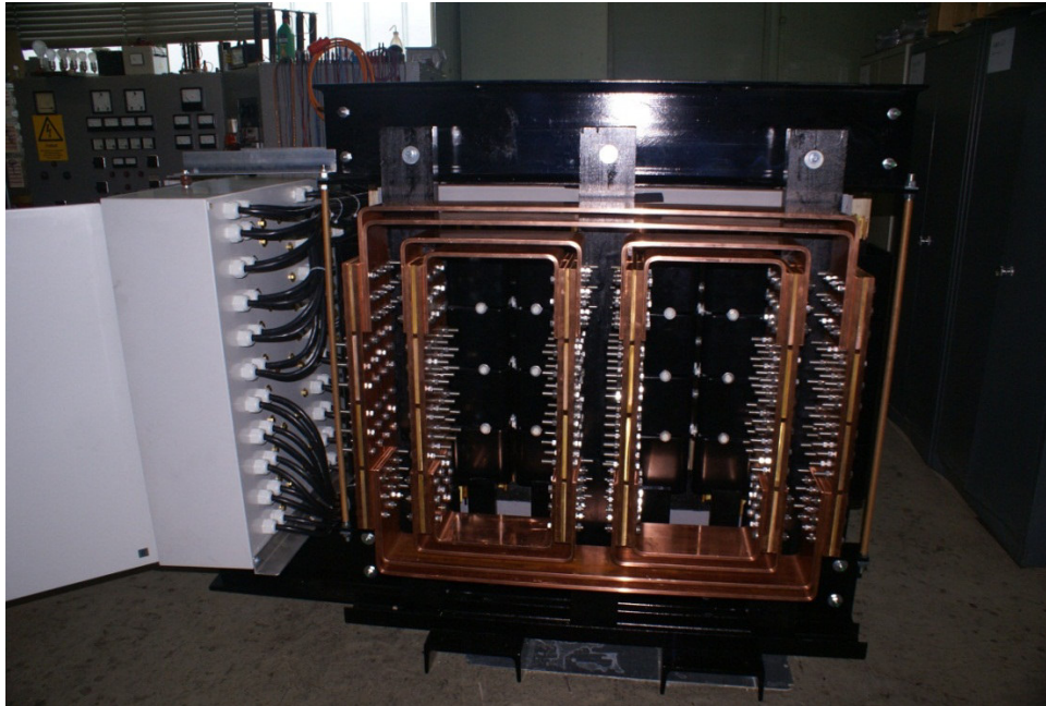
Isolation transformer 800 kVA Primary 3 x 400 Volt; Secondary 3 x .4 .... 19 Volt; 3 x 22790 A Via primary reversible in 10 steps Secondary view