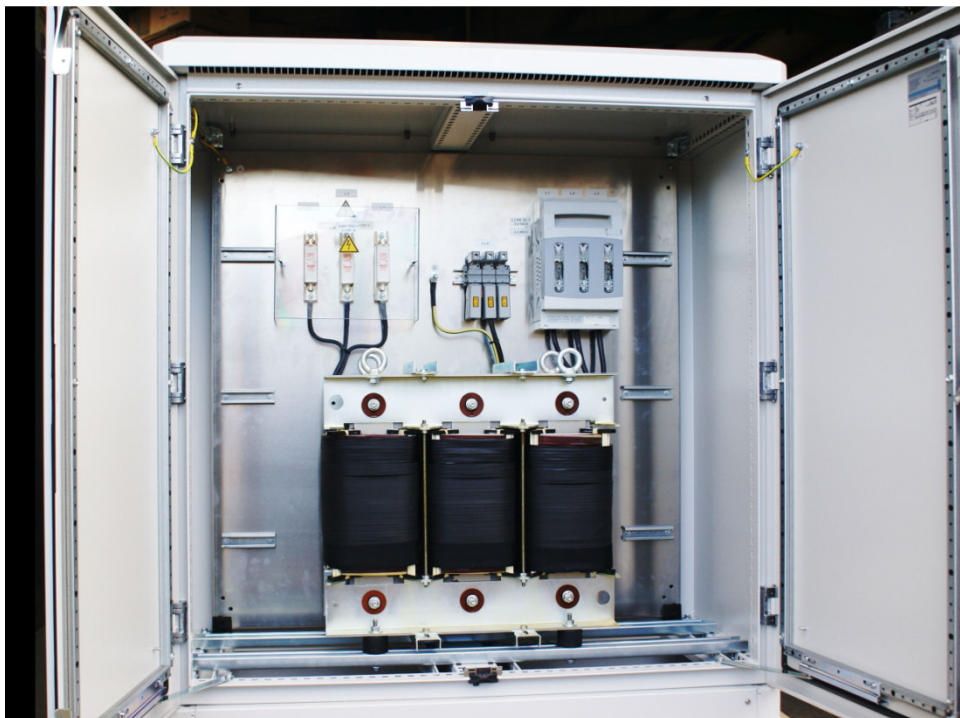
Outdoor transformer for electricity supplier