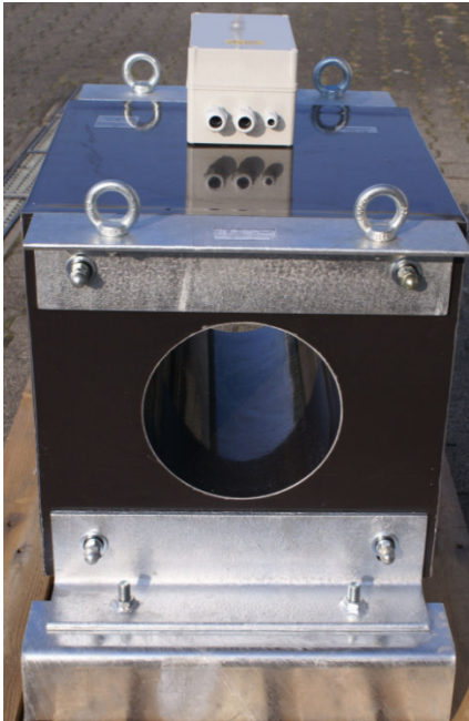
Cable check transformer 80 KVA